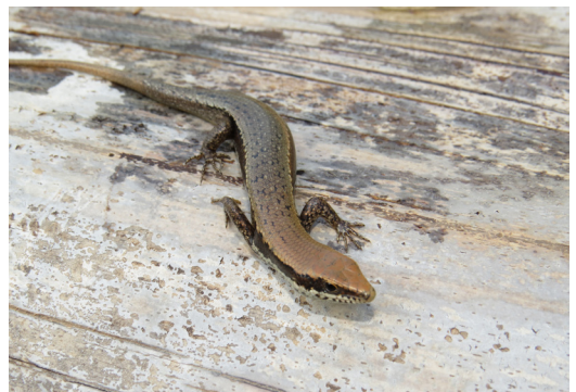
Figure 1. Specimen of Notomabuya frenata collected in the municipality of Santo Antônio Lopes, state of Maranhão, northern Brazil.